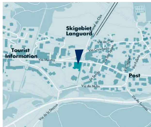
Pontresina: Bellavita Wellness Pool and SPA Via Maistra 178, CH-7504 Pontresina